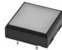
LED Changes for JL Illuminated Tactiles

The JL Illuminated Tactiles will have a change to the LED specifications for Red, Amber and Green. The change will effect all illuminated models, both standard and custom. The specification changes are outlined below, followed by effected standard part numbers.