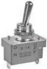
Changes for S Toggles

2. S Toggles with UL approval, both standard and custom, will have a change to the UL factory code. The table below illustrates the modification, followed by the effected part numbers.