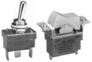
Changes for S Toggles & SW Rockers