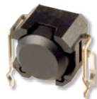
DSB Tilt Switch