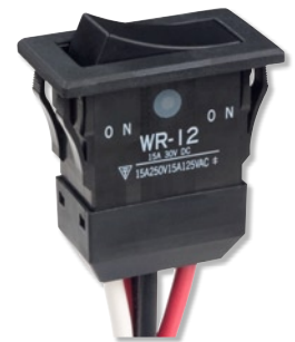
WB, WR, WT Environmentally Sealed Pushbuttons, Rockers, Toggles