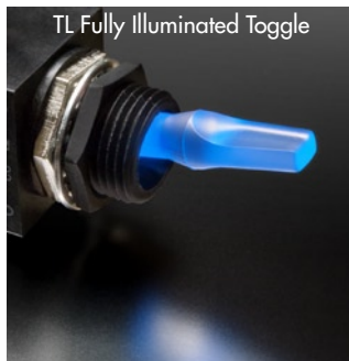
TL Fully Illuminated Toggle