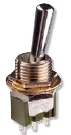
M Series with Large Bushing & Large Bar