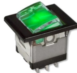
MLW Rocker with Sculptured Cap