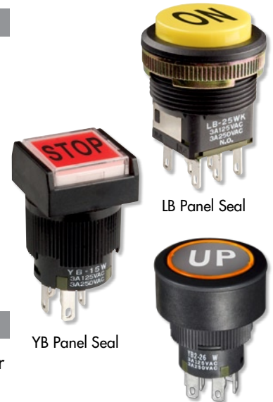
LB Panel Seal