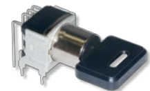
SK Keylock Switch

Five types of keylock switches for different security needs and environments – from antistatic subminiature to high security standard size.