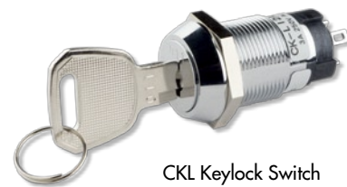
CKL Keylock Switch