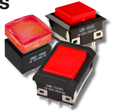
UB & UB2 Series with Bright Red LEDs will Undergo Changes