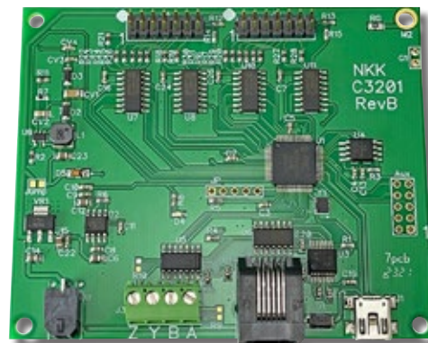
IS-C3201 Intelligent Controller