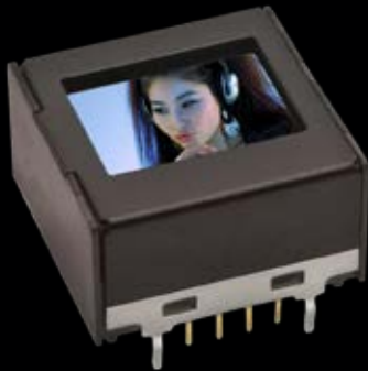
OLED Display Download Specs