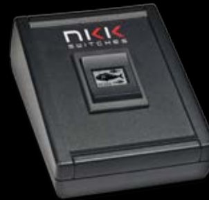
OLED Rocker IS-Dev Kit-8 Download Specs