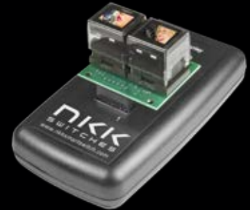
Dev Kits Download Specs