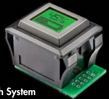
IS-S0108 One-Switch System Download Specs