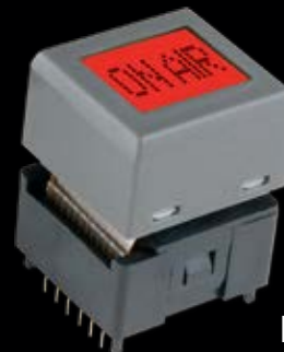
LCD Pusbuttons & Displays Download Specs