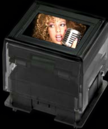
OLED Pushbutton Download Specs