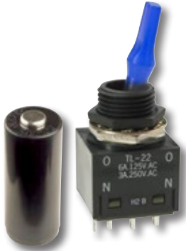
Changes for TL & DS Series

Effected standard part numbers for TL Series and DS Series are displayed on page 2.